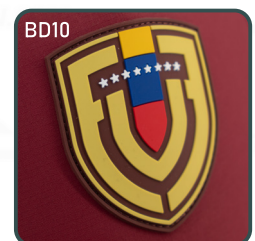
PVC RUBBER PATCH