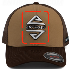
FRONT FROM 0.38 USD