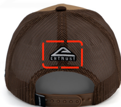
BACK FROM 0.19 USD