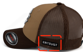
LEFT SIDE FROM 0.19 USD