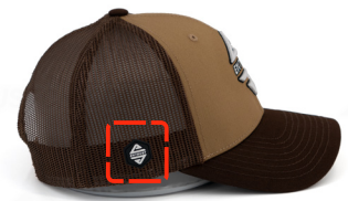
RIGHT SIDE FROM 0.26 USD