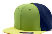
OLIVE GREEN+YELLOW +NAVY 6128