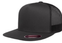
DARK HEATHER GREY 5003