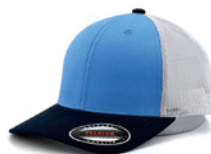
NAVY+SKY BLUE +WHITE 6373