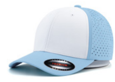
SKY BLUE+WHITE 6842