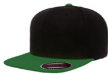
BLACK+NEON GREEN 6019