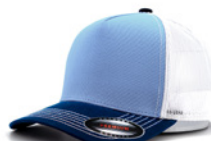
SKY BLUE+NAVY+WHITE 5350