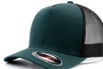
OLIVE GREEN+BLACK 5342