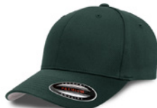
OLIVE GREEN 6507