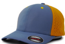
SKY BLUE+ORANGE 6821