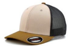
OCHRE YELLOW+MUSCLE +GREY 6365