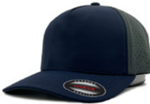
NAVY+DARK GRAY 5514