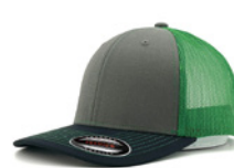
BLACK+HEATHER +KELLY 6369