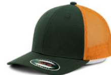
CHARCOAL+NEON +ORANGE 6340