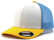
EARTHY YELLOW+WHITE +SKY BLUE 6361