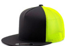
CHARCOAL+NEON GREEN 5031