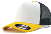
YELLOW+WHITE +BLACK 5337