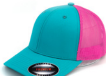
SKY BLUE + NEON PINK 6377