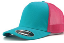
SKY BLUE+NEON PINK 5338