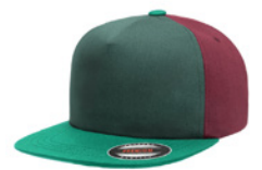
DARK-GREEN+GREEN +RED 5130