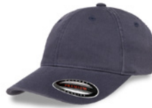
DARK GRAY 6403