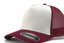
WINE RED+WHITE +WINE RED 5335