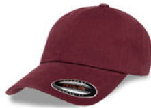
WINE RED 6407