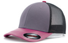
WINE RED+CHARCOAL +BLACK 6D10