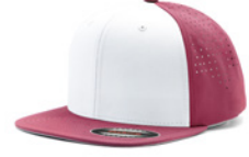
WHITE+WINE RED 6115