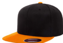
BLACK+NEON ORANGE 6024