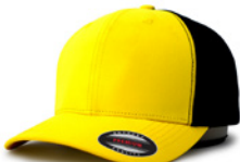
LEMON YELLOW+BLACK 6816