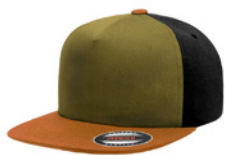
OLIVE-GREEN+ORANGE +BLACK 5127