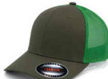
OLIVE GREEN+GREEN 6378