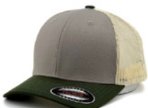
OLIVE GREEN+HEATHER +KHAKI 6371