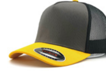
YELLOW+CHARCOAL +BLACK 5340