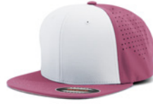
WINE RED+WHITE 6145