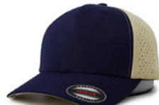
NAVY+LIGHT YELLOW 6812