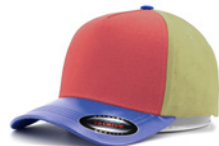
NAVY+RED+LIGHT GREEN 5828