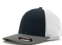
HEATHER+BLACK +WHITE 6372