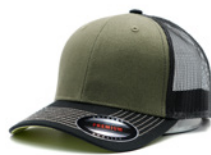
OLIVE GREEN+BLACK 6388