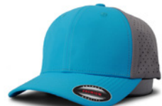
LAKE BLUE+GREY 6815