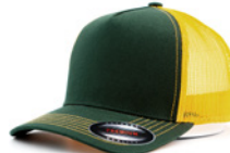
OLIVE GREEN+YELLOW 5344