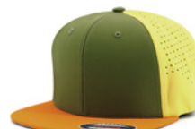
OLIVE GREEN+ORANGE +YELLOW 6129