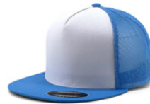
CAROLINA BLUE+WHITE +CAROLINA BLUE 5019