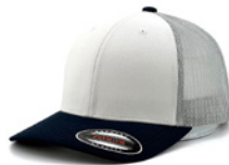
NAVY+WHITE +HEATHER 6363