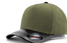
BLACK+OLIVE GREEN 5824