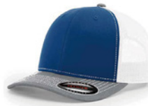
HEATHER+ROYAL +WHITE 6364