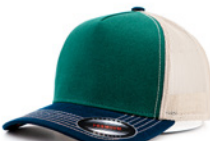
OLIVE GREEN+NAVY +KHAKI 5347