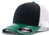
OLIVE GREEN+BLACK +WHITE 5417