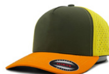
ORANGE-YELLOW +ARMYGREEN+YELLOW 5536