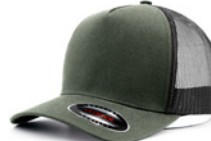
DARK HEATHER GREY +BLACK 5334