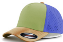
ORANGE+GREEN +ROYAL 5619