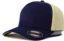
NAVY+LIGHT YELLOW 5512