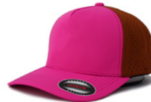
ROSE RED+BROWN 5526