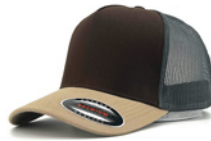
WHEAT+LIGHT BROWN +GREY 5333