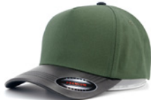
BLACK+OLIVE GREEN 5817