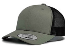
OLIVE DRAB+BLACK 6352