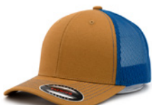
OCHRE YELLOW +ROYAL 6356