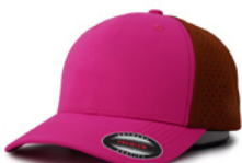
ROSE RED+BROWN 6826