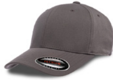
DARK HEATHER GREY 6502