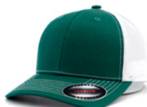
OLIVE GREEN+WHITE 63114