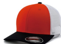
BLACK+ORANGE +WHITE 6374