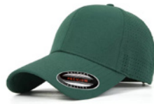
TURQUOISE GREEN 6808