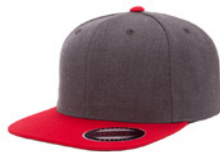
DARK HEATHER+RED 6018