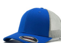
STEEL BLUE+SILVER 6343