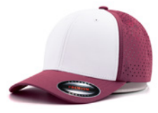
WINE RED+WHITE 6846