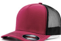
WINE RED+BLACK 5352