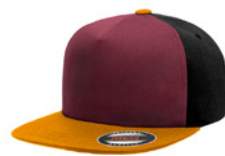
WINE-RED+ORANGE +BLACK 5129