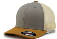
OCHRE YELLOW+HEATHER +KHAKI 6370