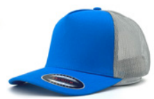
STEEL BLUE+SILVER 5325