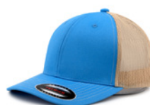
SKY BLUE+KHAKE 6358