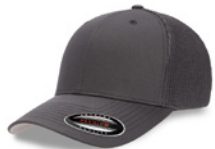
DARK HEATHER GREY 6336