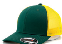
EVERGREEN +LEMON YELLOW 6357