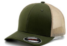
OLIVE GREEN +KHAKI 6375