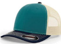
NAVY+MINT TURQUOISE +KHAKI 6366