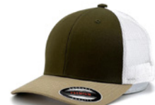
WHEAT+OLIVE GREEN +WHITE 6350