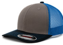
BLACK+HEATHER +ROYAL 6368