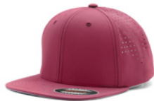
WINE RED 6102