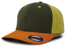
ORANGE-YELLOW +ARMYGREEN+YELLOW 6836