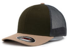
WHEAT+LIGHT BROWN +GREY 6351