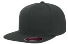
HEATHER GREY 6010