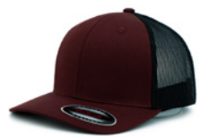
COYOTE BROWN +BLACK 6330