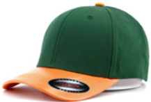
GREEN+OLIVE GREEN 6A06