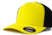
LEMON YELLOW+BLACK 5516