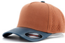
ORANGE+DARK CYAN 5602