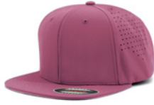
WINE RED 6144