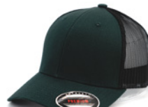
DARK HEATHER GREY +BLACK 6379