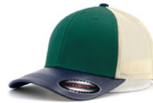
NAVY+OLIVE GREEN +KHAKI 6D09