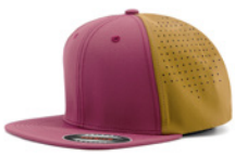
WINE RED+OCHRE YELLOW 6116