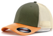
ORANGE+OLIVE GERRN +KHAKI 6D11