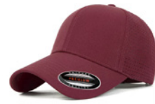
WINE RED 6809