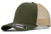
OLIVE GREEN +KHAKI 5336