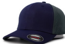
NAVY+DARK GRAY 6814