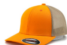
RUSTIC ORANGE +KHAKE 6345