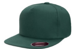
DARK GREY + STRING 5110