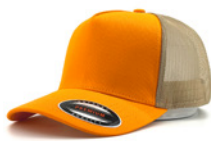
RUSTIC ORANGE+KHAKE 5327