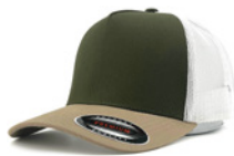
WHEAT+OLIVE GREEN +WHITE 5332