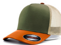
ORANGE+OLIVE-GREEN +KHAKE 5428