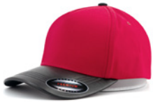
BLACK +RED 5801