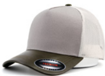
DARK GREEN+SILVER +KHAKE 5421