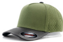
OLIVE GREEN+BLACK 5608