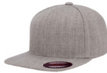
DARK GREY 6009