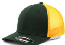
CHARCOAL+NEON +GREEN 6341