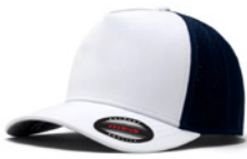
WHITE+DARK BLUE 5550