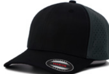
BLACK+DARK GRAY 6813