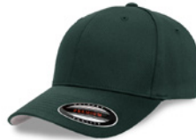
DARK GREEN 6408