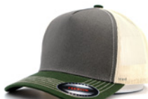
OLIVE GREEN+CHARCOAL +KHAKI 5349