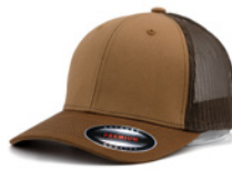
CARAME+OCHRE YELLOW +BROWN 63103