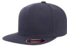
DARK NAVY 6008