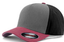
WINE-RED+GRAY +BLACK 5922