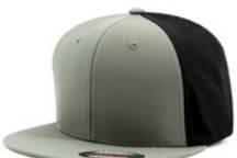
OLIVE GREEN+BLACK 6126