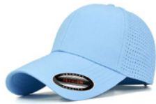
SKY BLUE 6802