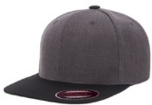
DARK HEATHER+BLACK 6012