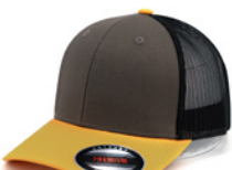
YELLOW+CHARCOAL +BLACK 6381