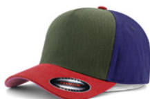
RED+OLIVE-GREEN +NAVY 5927