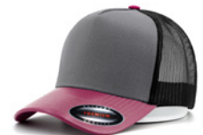
WINE RED+GRAY +BLACK 5410