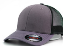
PURPLE+CHARCOAL +BLACK 63110