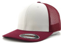
WINE RED+WHITE +WINE RED 6362