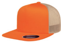
RUSTIC ORANGE+KHAKI 5032