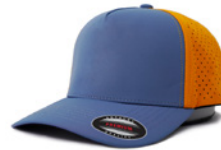
SKY BLUE+ORANGE 5521