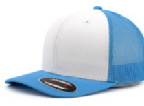
CAROLINA BLUE+WHITE 6314