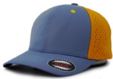
SKY BLUE+ORANGE 6821