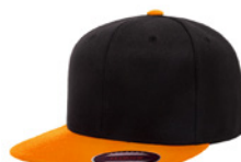
BLACK+NEON ORANGE 6024