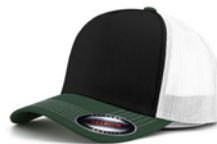
OLIVE-GREEN+BLACK +WHITE 5379