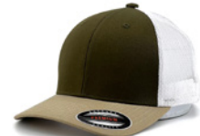
WHEAT+OLIVE GREEN +WHITE 6350