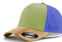
ORANGE+GREEN +ROYAL *5619