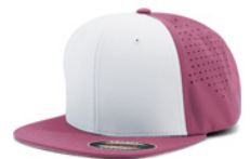
WINE RED+WHITE 6145