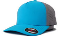
LAKE BLUE+GREY 5515