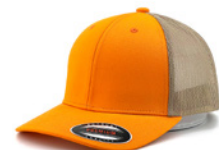
RUSTIC ORANGE +KHAKE 6345