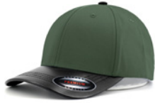
BLACK+OLIVE GREEN 6A17