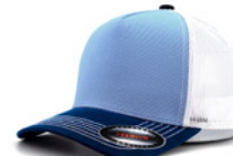
SKY BLUE+NAVY+WHITE 5350