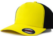
LEMON YELLOW+BLACK 5516