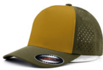
OCHRE-YELLOW +OLIVE-GREEN *5552