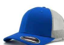
STEEL BLUE+SILVER 6343