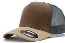
WHEAT+LIGHT BROWN +GREY 5333