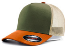
ORANGE+OLIVE-GREEN +KHAKE 5411