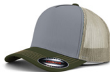
DARK-GREEN+GRAY +KHAKI 5383