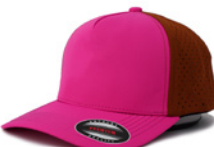
ROSE RED+BROWN 5526