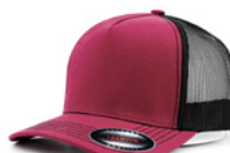
WINE RED+BLACK 5352