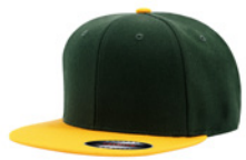
YELLOW+OLIVR GREEN 6026