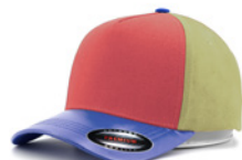
NAVY+RED+LIGHT GREEN *5828