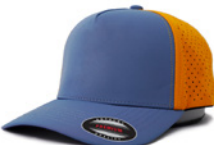
SKY BLUE+ORANGE 5521