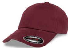
WINE RED *6407