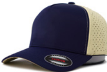
NAVY+LIGHT YELLOW 5512