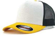
YELLOW+WHITE +BLACK 5337