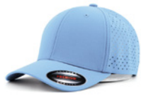
SKY BLUE 6802