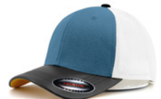
BLACK+DARK-BLUE +WHITE 6D20