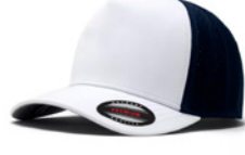
WHITE+DARK BLUE 5550