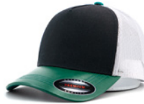
OLIVE GREEN+BLACK +WHITE 5417