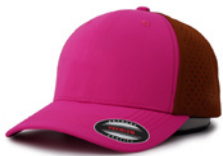
ROSE RED+BROWN 6826