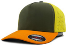
ORANGE-YELLOW +ARMYGREEN+YELLOW 5536