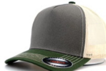
OLIVE GREEN+CHARCOAL +KHAKI 5349