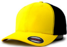
LEMON YELLOW+BLACK 6816