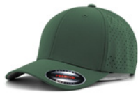
TURQUOISE GREEN 6808