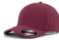
WINE RED 6809