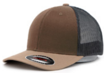
WHEAT+LIGHT BROWN +GREY 6351