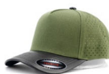
OLIVE GREEN+BLACK 5608