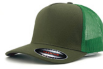
OLIVE GREEN+GREEN 5339