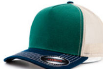
OLIVE GREEN+NAVY +KHAKI 5347